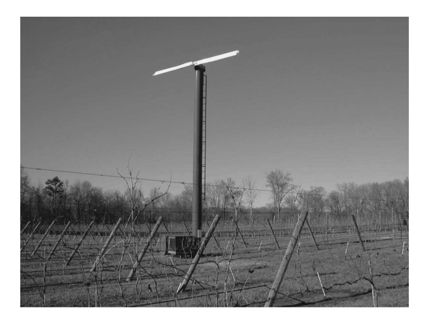
Fig. 5. This Orchard-Rite, Ltd. (Yakima, WA) wind machine stands 10.7 m above the vineyard floor and has a gas-powered engine that turns a 5.8-m fan. It protects a 2.83-ha vineyard in Davidson County, NC. The fans or propellers minimize cold air stratification in the vineyard and bring in warmer air from the thermal inversion. The amount of protection or temperature increase in the orchard depends on several factors. However, as a general rule, the maximum that the air temperature can be increased is ≈50% of the temperature difference (thermal inversion strength) between the 1.8- and 15.2-m levels. Thus, these machines are generally not very effective with minimum temperatures below −2.2 °C. (Photo by Barclay Poling, 18 Dec. 2005.)

4. Dew point temperatures slightly below the critical temperature. Under a radiational cooling scenario with DP temperatures in the range of -2.7 to -1.1 °C, which may be slightly below a "critical temperature" for a young grape shoot of -0.55 °C (Sugar et al., 2003), it is recommended that the grower start wind machine protection when thermometers in the coldest spots in the vineyard have dropped into the range of 0 to 1.1 °C (Evans, 2000). It is not recommended that the grower start protection at air temperatures that are