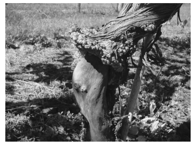
Fig. 3. Photo taken on 11 Sept. 2007 from commercial vineyard in Missouri showing Easter freeze 2007 trunk injury on Chardonel (an interspecific hybrid). Chardonel vines recovered from the freeze only to have crown gall show up mid to late summer. Crown gall is now a widespread problem in vineyards all over the states of Missouri and Arkansas as a result of this freeze.

Practical considerations rule out irrigation. A grower must consider a number of economic as well as practical considerations when deciding whether to invest in an active cold protection system or method, and difficult tradeoffs are generally involved.