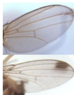
Non SWD wing (top) and male SWD wing (bottom). Not all small brown flies with spots on their wings are SWD. See here for links to images of non SWD flies which also have spots on their wings: http://bit.ly/MfnKcy

SWD larvae and pupae cannot be distinguished from other Drosophila species, but Drosophila species can be distinguished from other insects which may be present in ripe fruit. Sampling only apparently sound, otherwise marketable fruit minimized the likelihood that non SWD larvae will be detected. Rotting or externally damaged fruit may contain native Drosophila species.