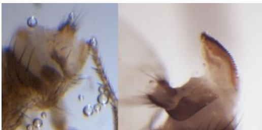
Non SWD ovipositor (left) and SWD ovipositor (right). Note that these flies have been stored in ethanol. Normally, the ovipositor would be concealed just inside the abdomen.

Adult SWD are small (2-3 mm) light brown flies. Male SWD have a distinctive spot on the end of either wing and dark bristles in bands around the base of the last segment on their front legs (called sex combs). Female SWD lack spots on their wings but can be distinguished by a relatively large, blade-like ovipositor (egg laying devise) at the end of their abdomen.