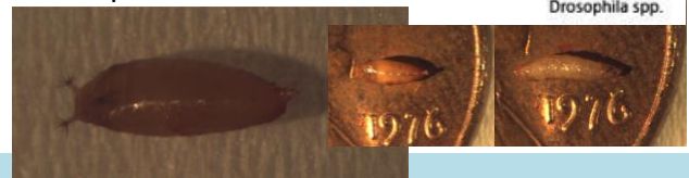
SWD pupa (left, middle) and nearly mature larva (right). Middle and right images use a penny as a backdrop for scale. Note star shaped “breathing tubes” on pupa. These are distinctive to Drosophila pupae in fruit.